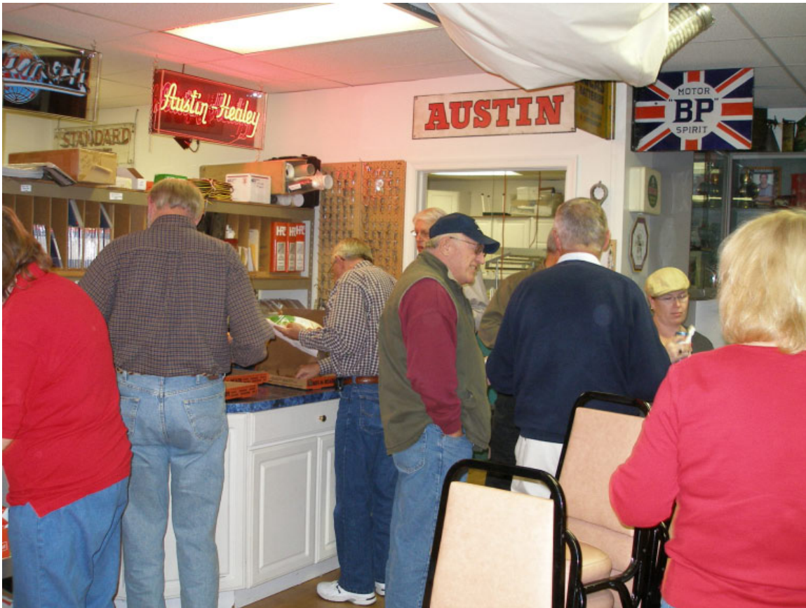
Snacking, Shopping and Chatting!

December 10 - LANCO Holiday Banquet. The Fireside Tavern at the Historic Strasburg Inn, Strasburg, PA. The event starts at 6:00 PM - with a cash bar until 7:00 PM. Please bring along any awards to share with the rest of the members.