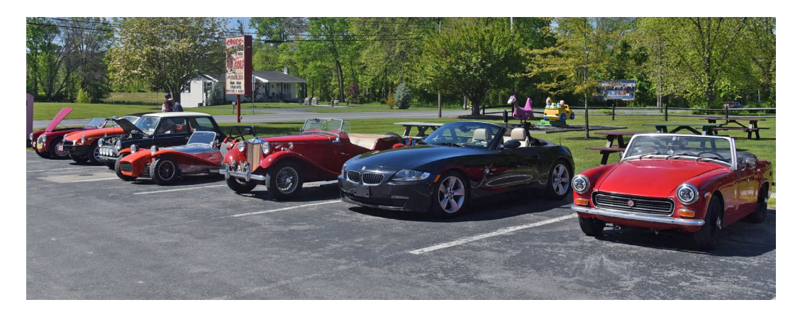
Nice Mix of Cars