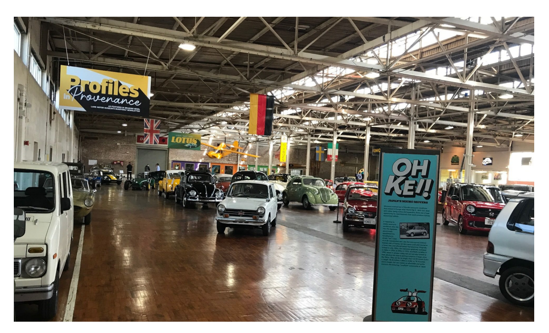
Lots of Unique Cars!