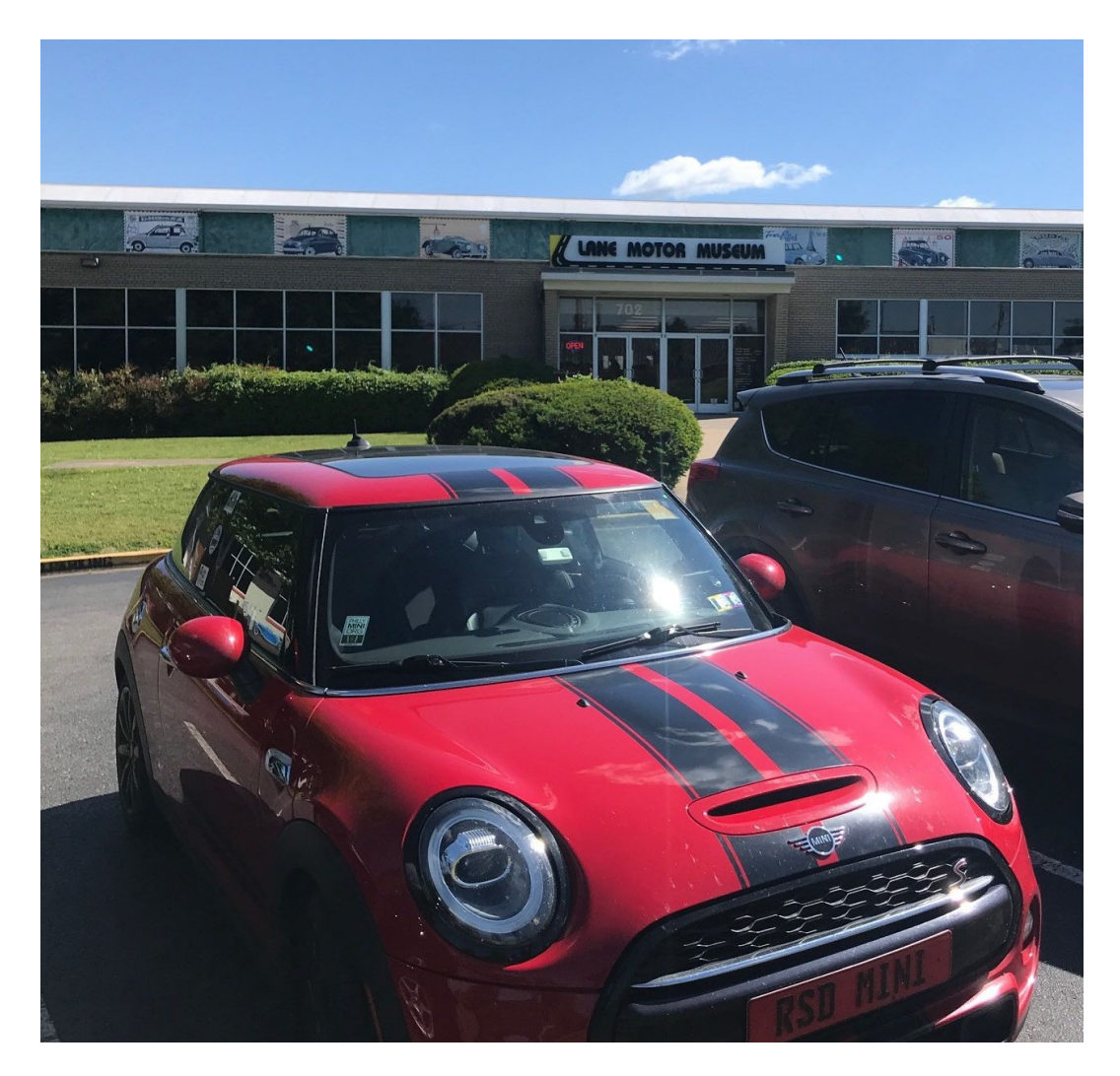
Stopping at Lane Motor Museum