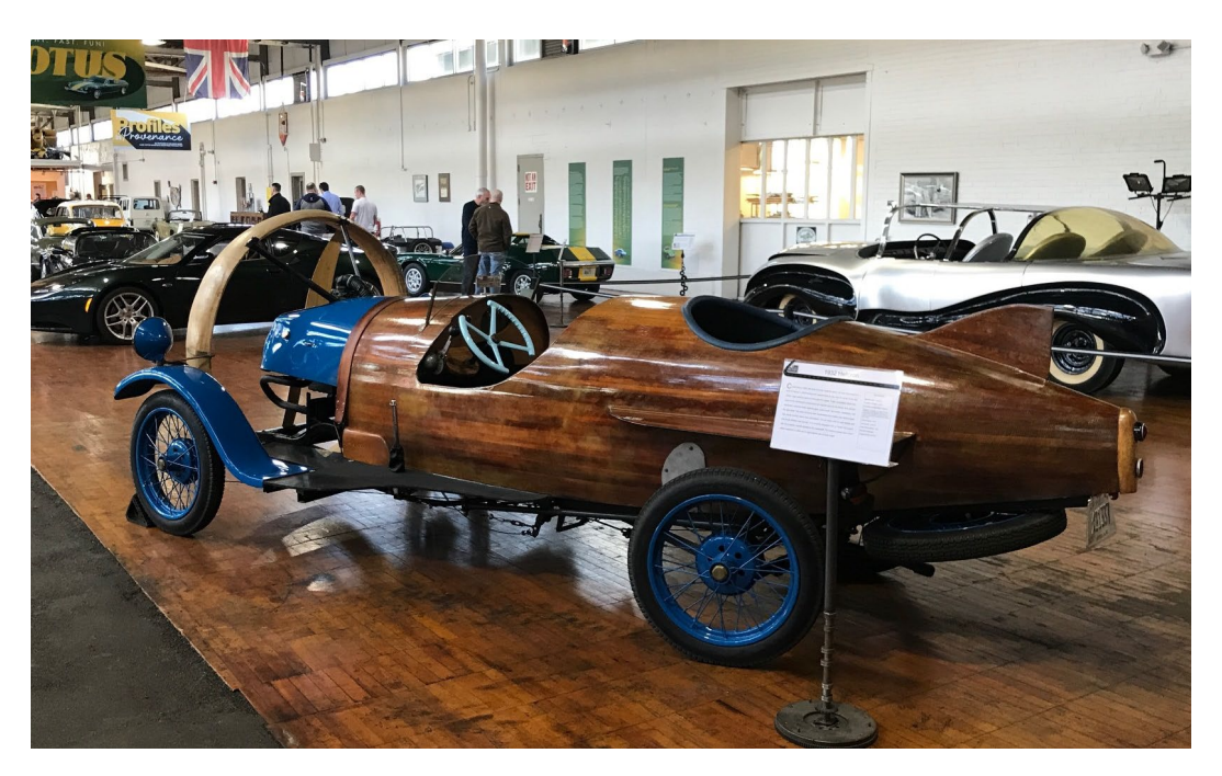
1932 Helicron Propeller Driven Car