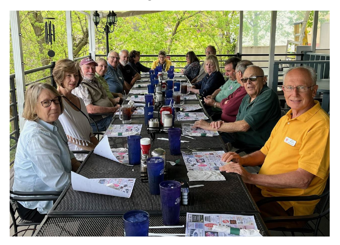
On the Deck at the Soda Jerk