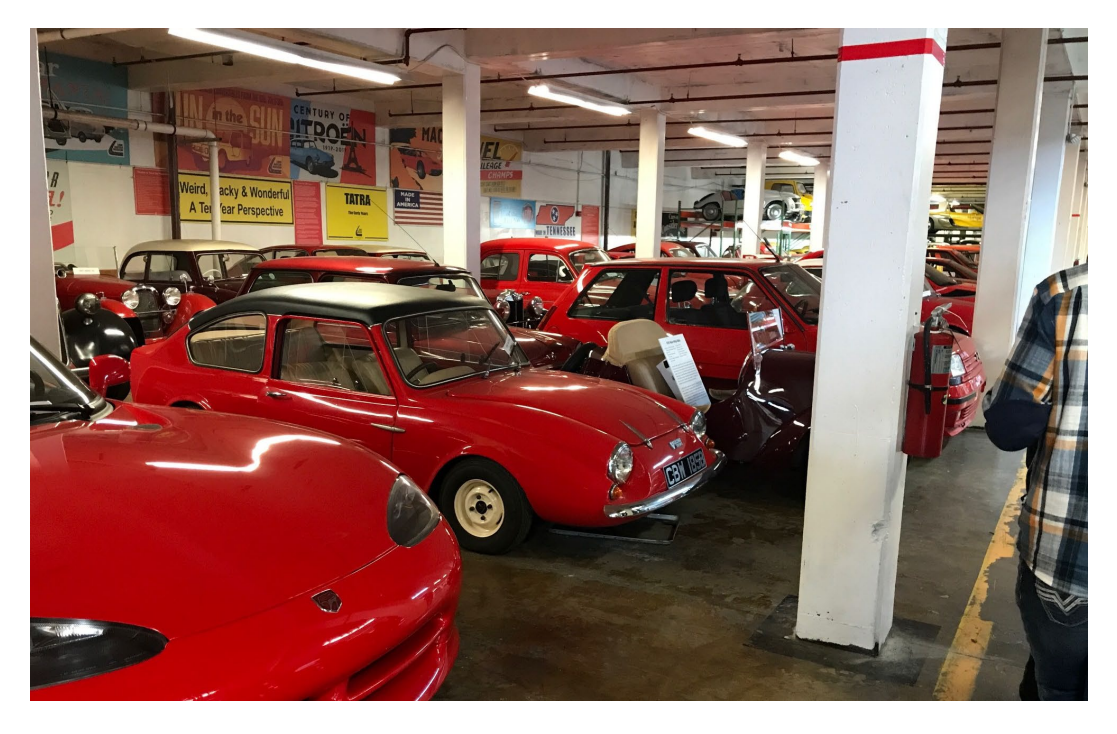
In the "Red" Section of the Basement