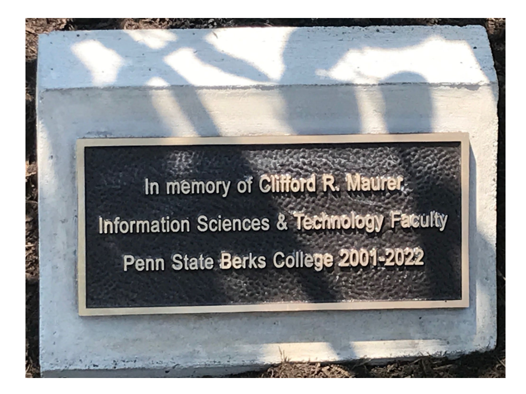
In Memory ...