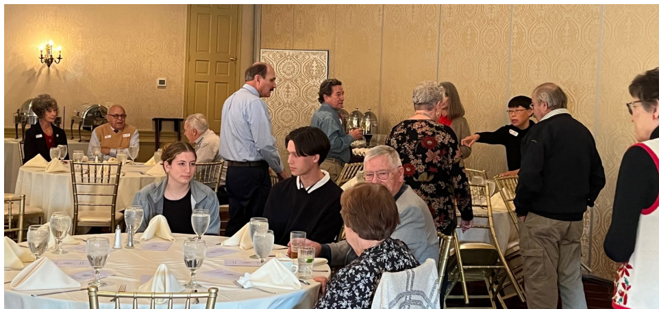
Pre-Dinner Conversations - 2