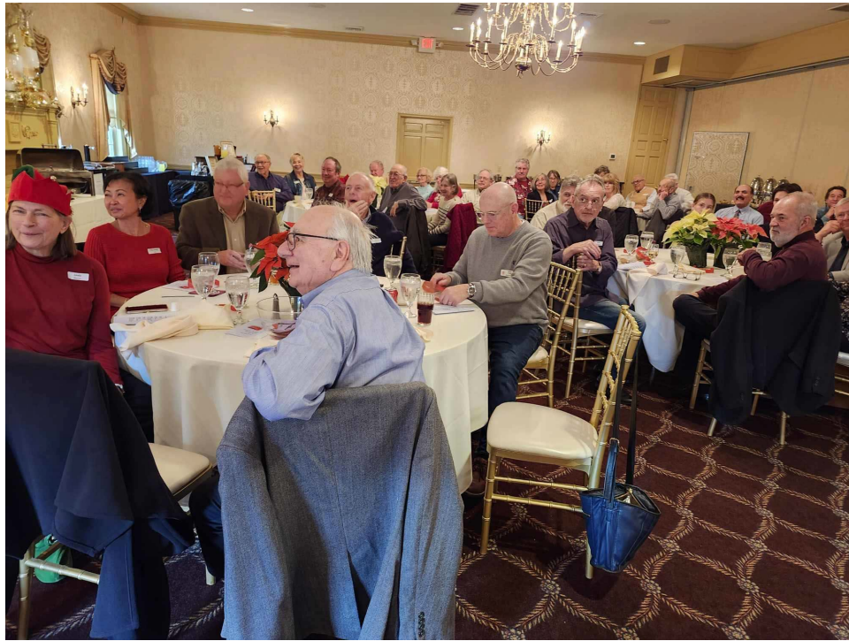
Listening to the Prez