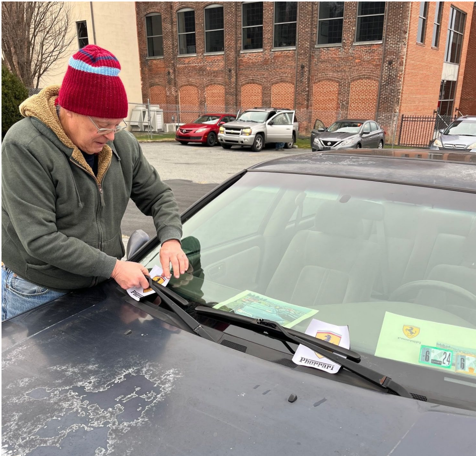
Badging the “Pherrari”