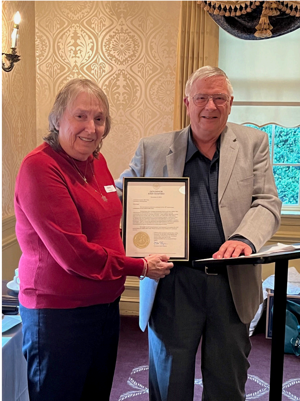
Congratulations from the Governor!