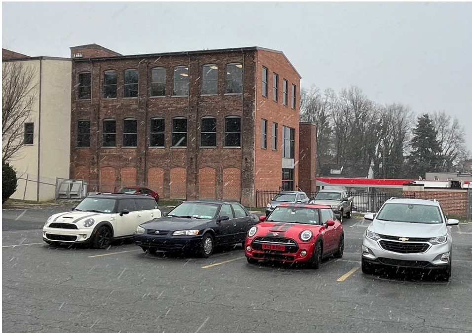
Two MINIs and a “Pherrari”