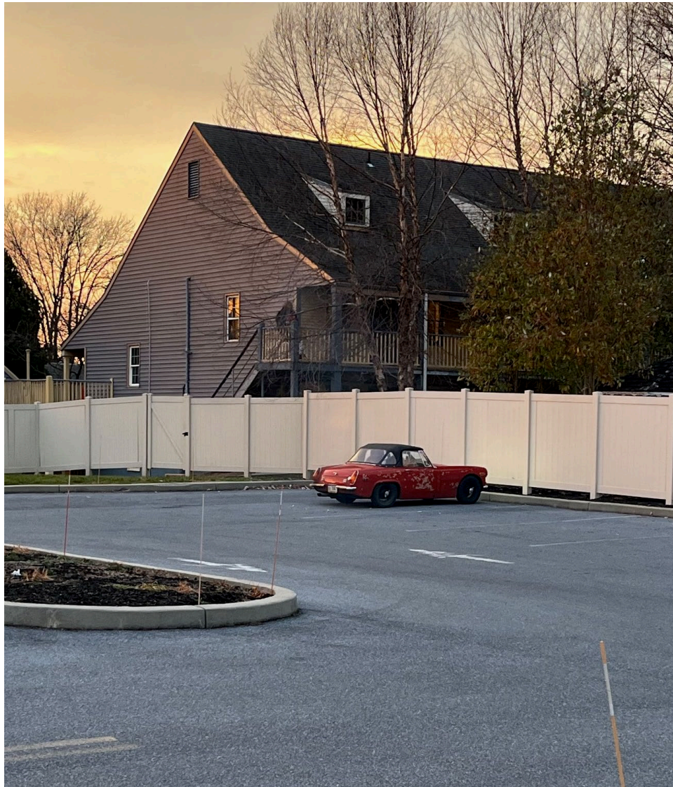
The Lonely British Car