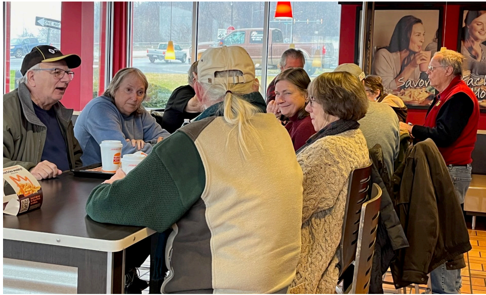
[ccc3] Dedicated CC&Cers