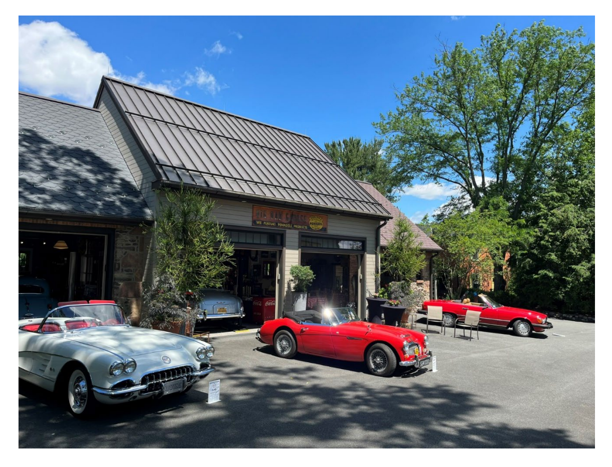
More fan favorites!