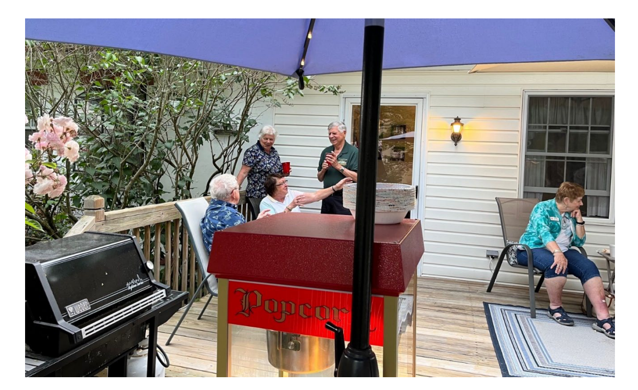
Chillin' on the Deck