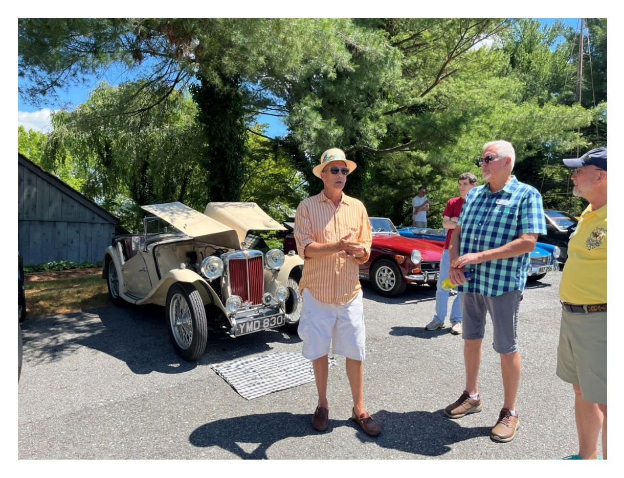
Tell us about your car