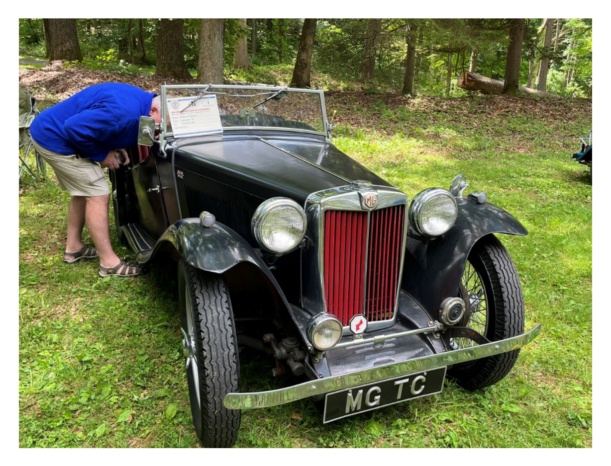
Checking out the new Interior