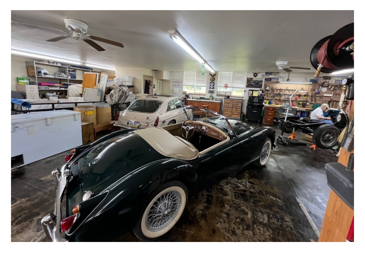
Garage Envy ...