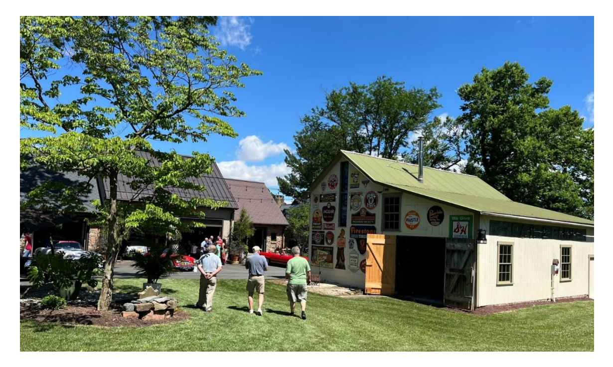
Heading to the Garage