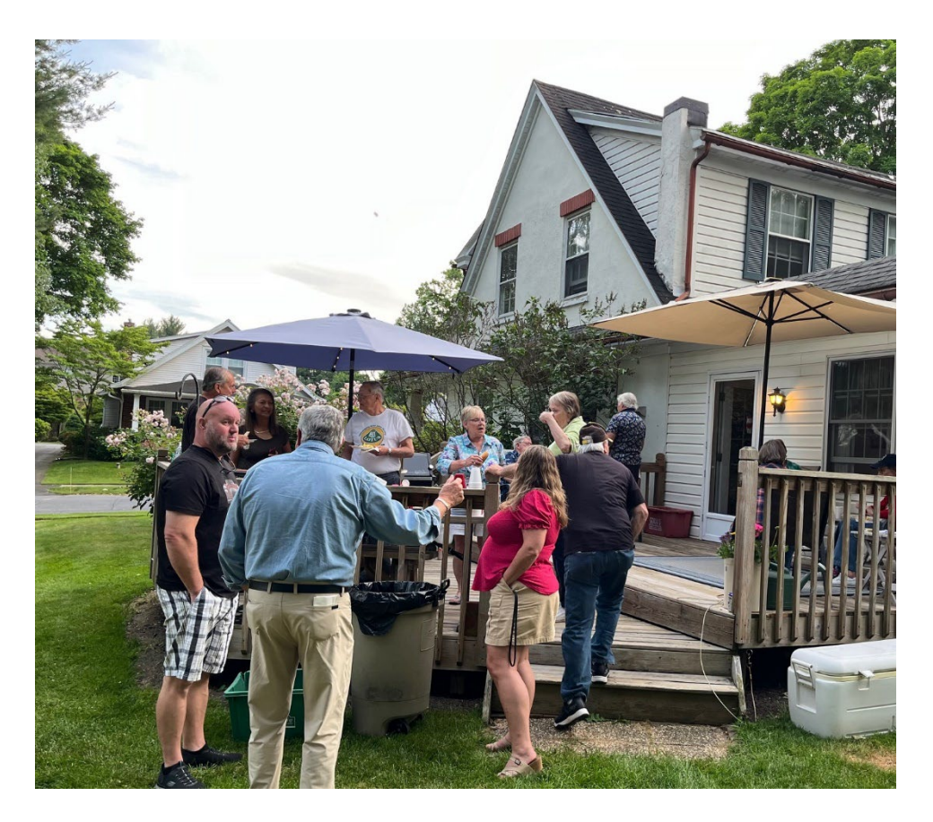
Movie Nite Get-together