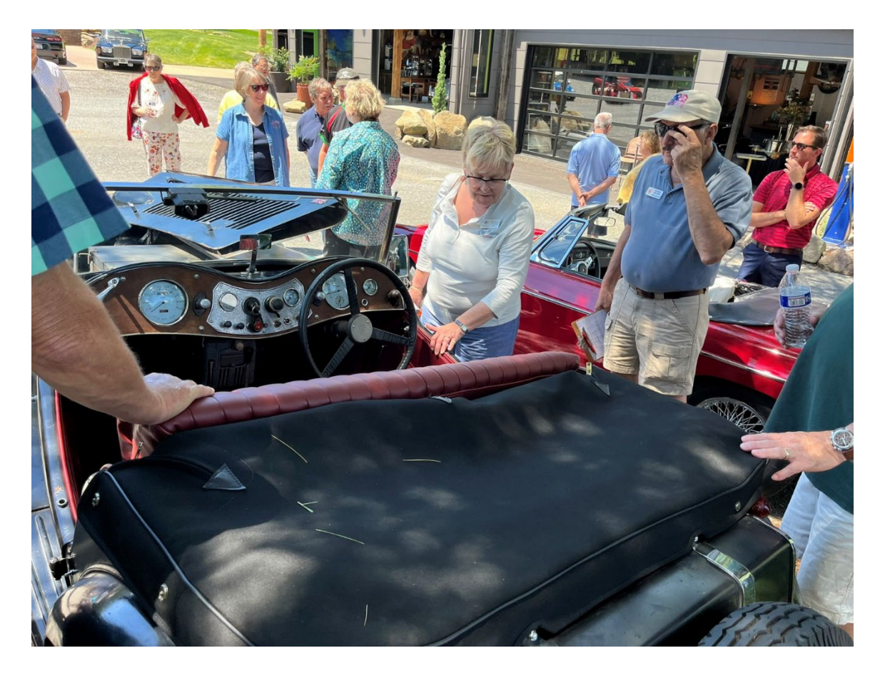
Checking out Deb's new upholstery