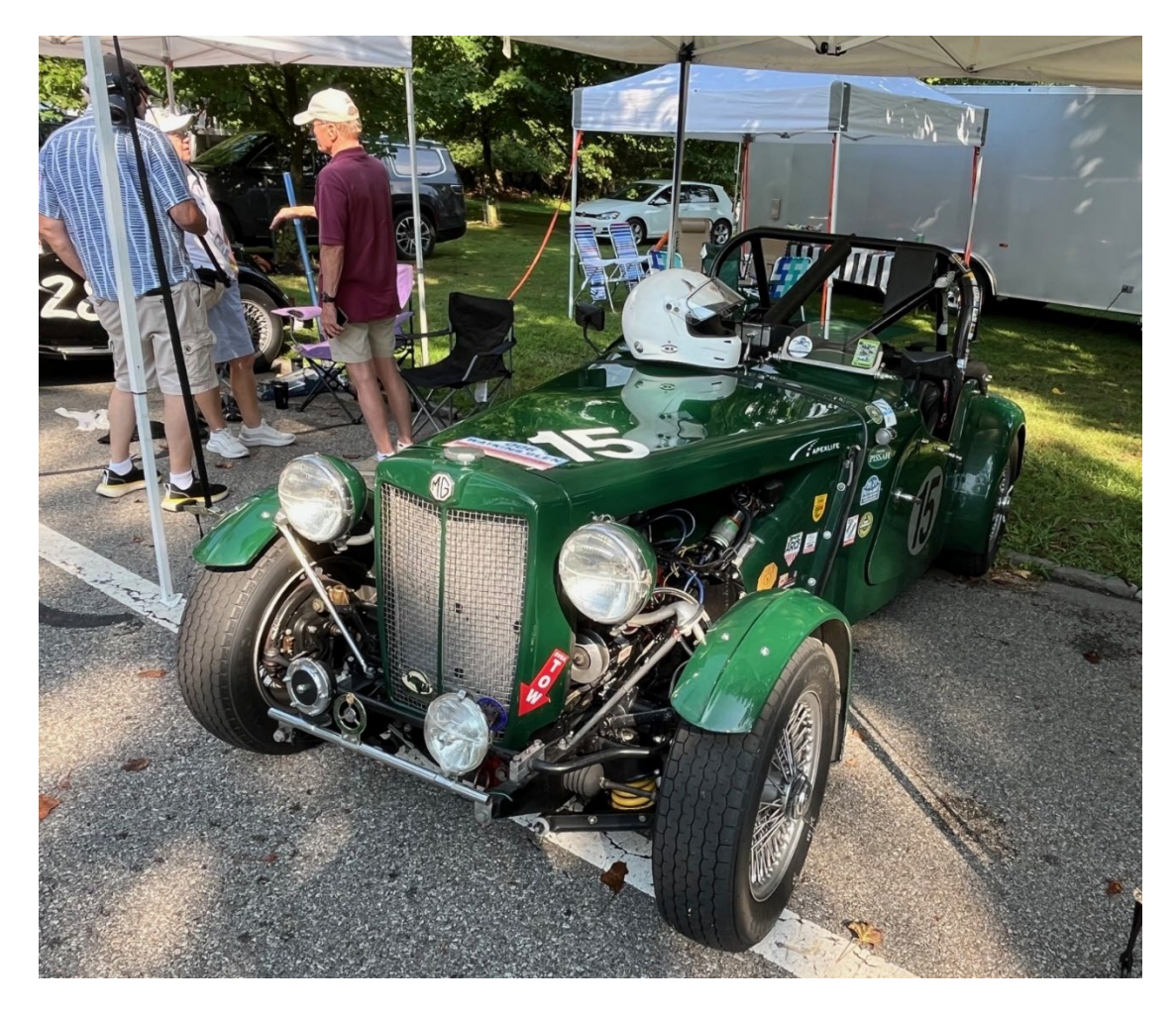
MG in the Paddock