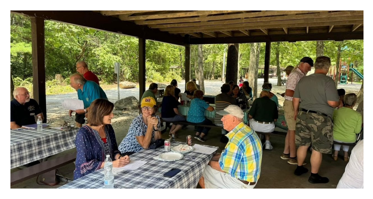
After Lunch Conversations