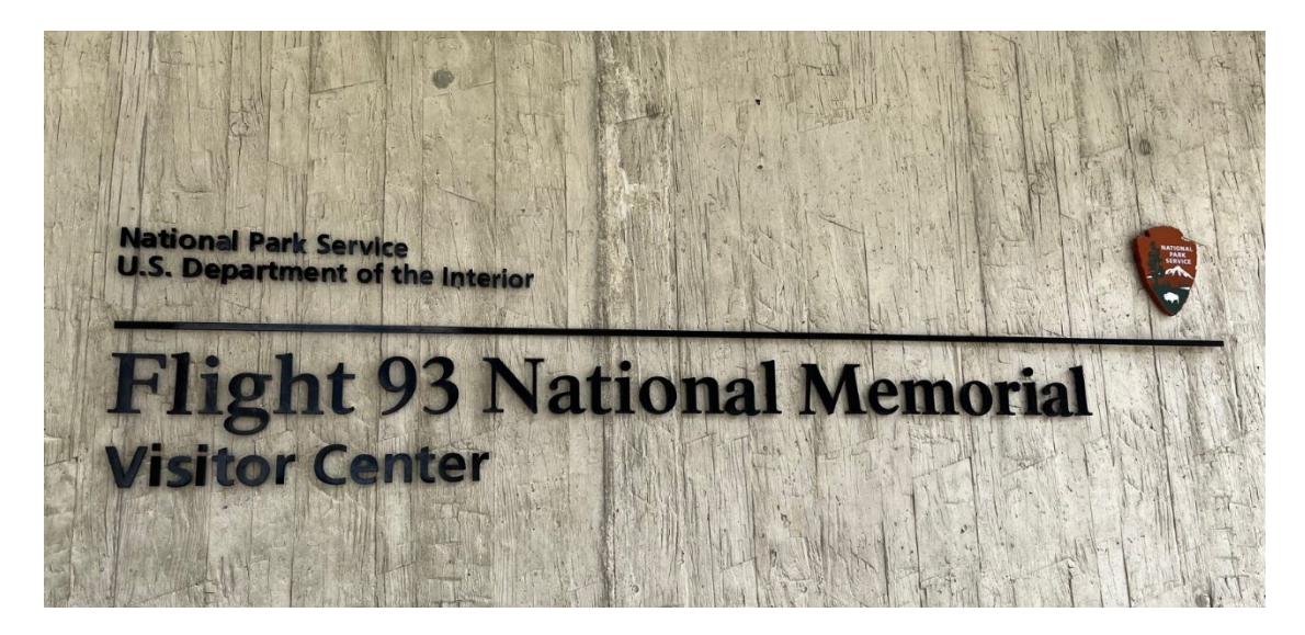
Stopping at the Flight 93 Memorial