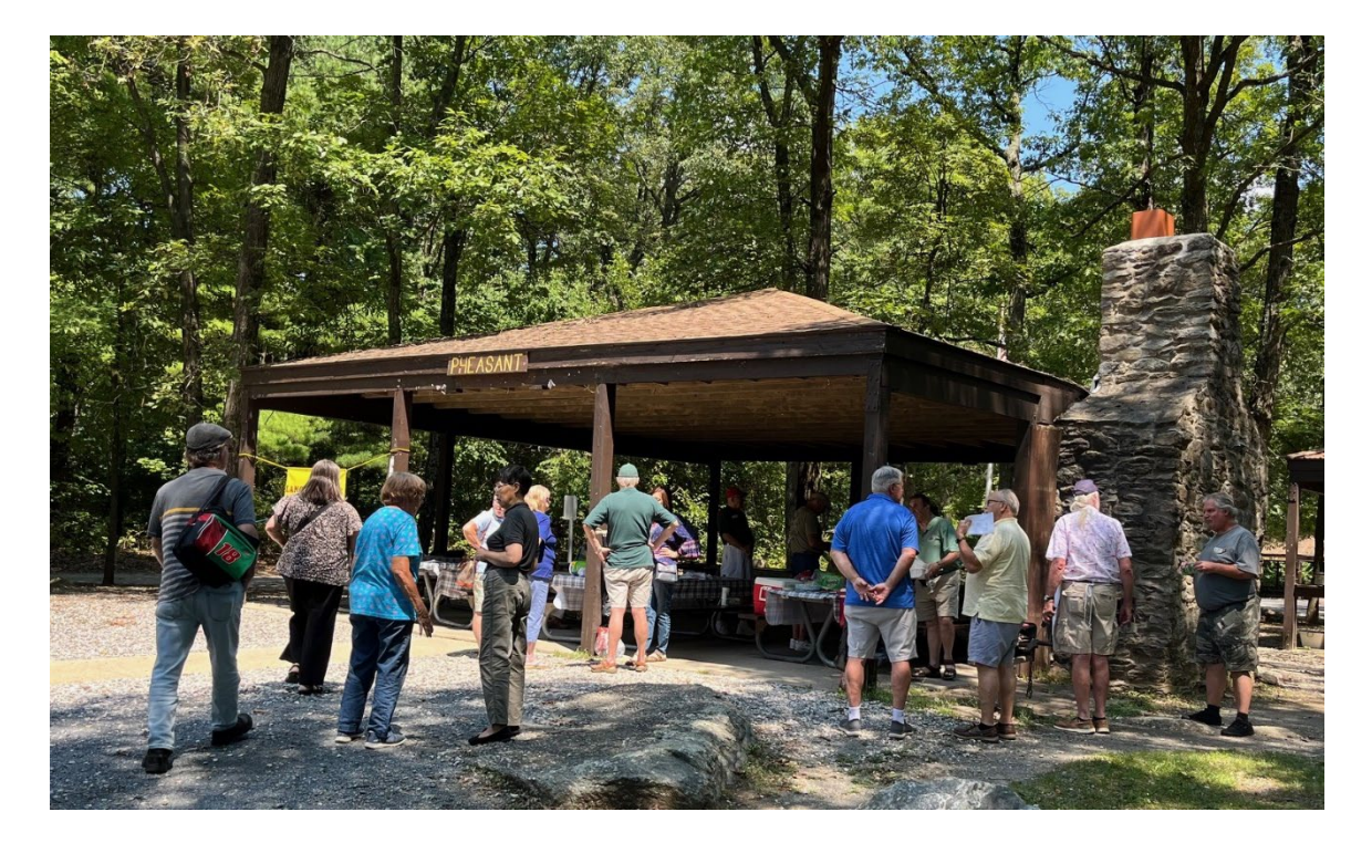
Arriving at the Pheasant Pavilion