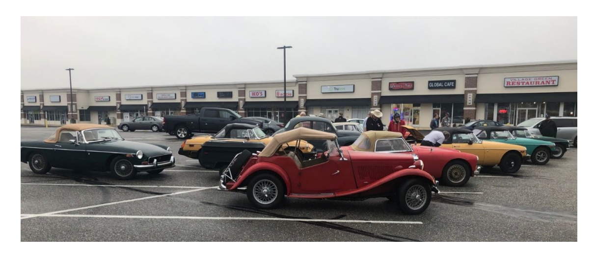
Ready to head to The Rocks!