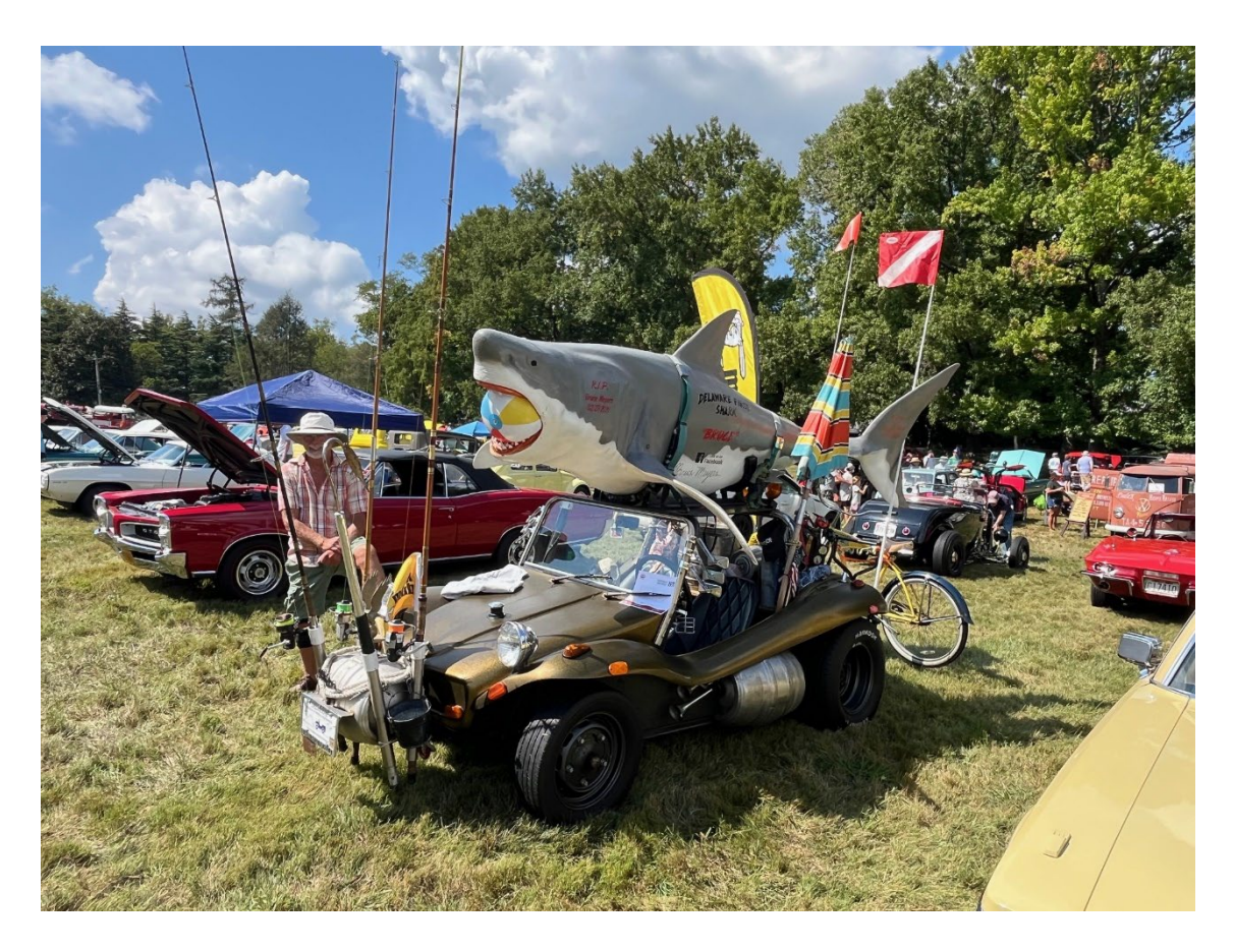
The Sharkmobile ("Bruce") was there!