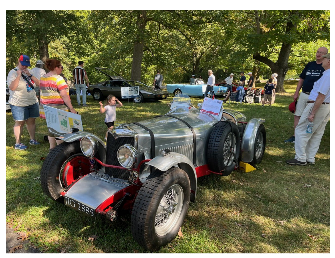
1938 Riley Special Race Car