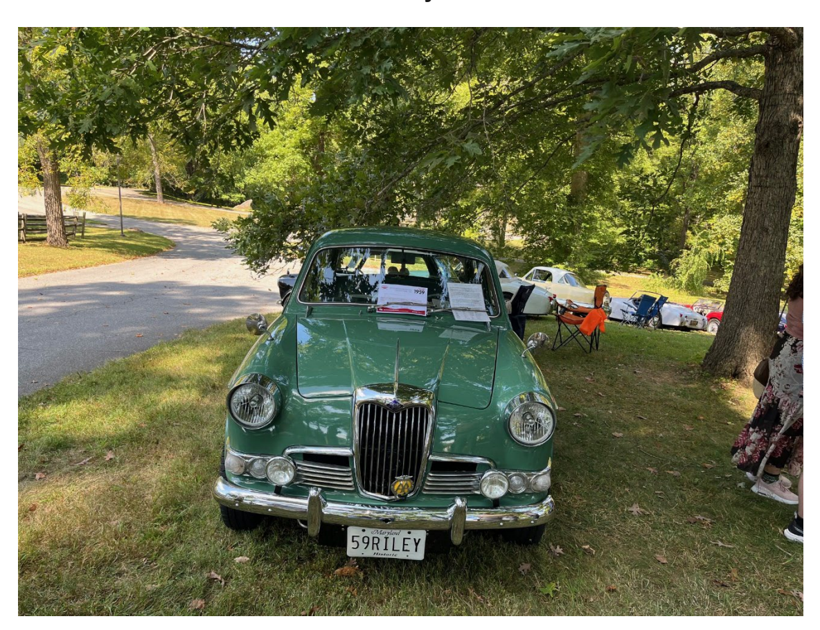
1959 Riley One Point Five