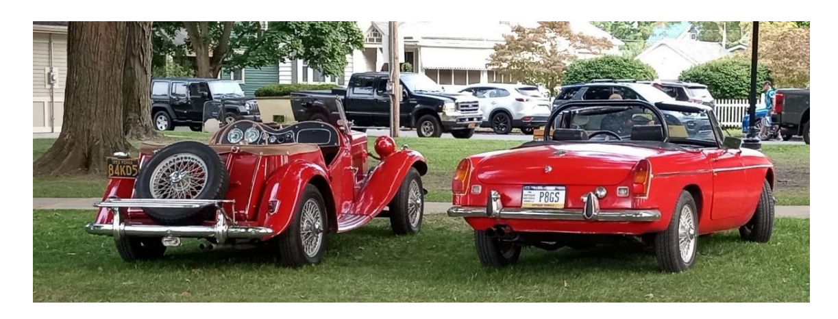
MGs in the Park