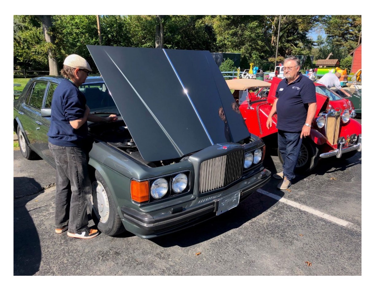
Bentley, TD and More