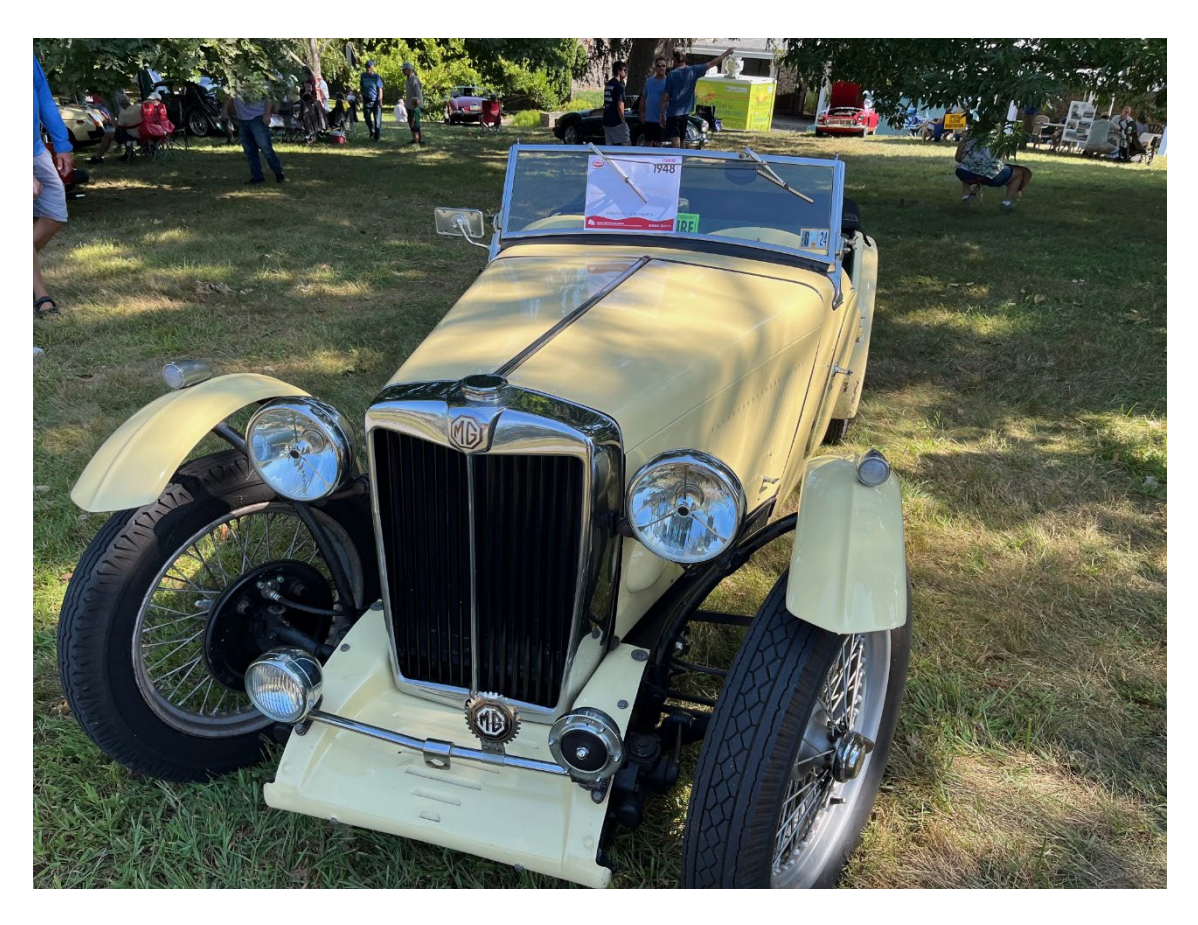
1948 MG-TC with Cycle Fenders