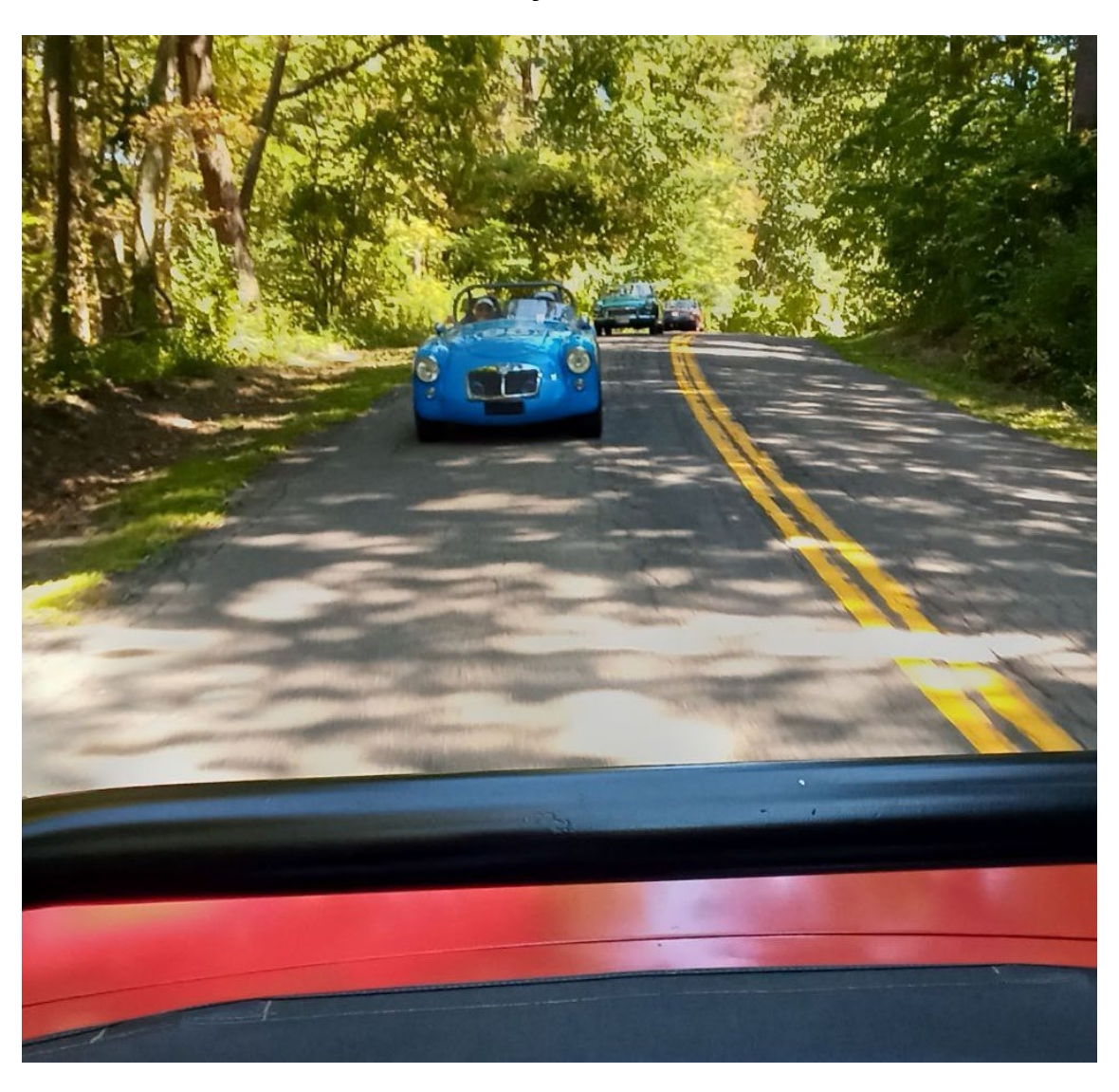
Cruising through the Woods