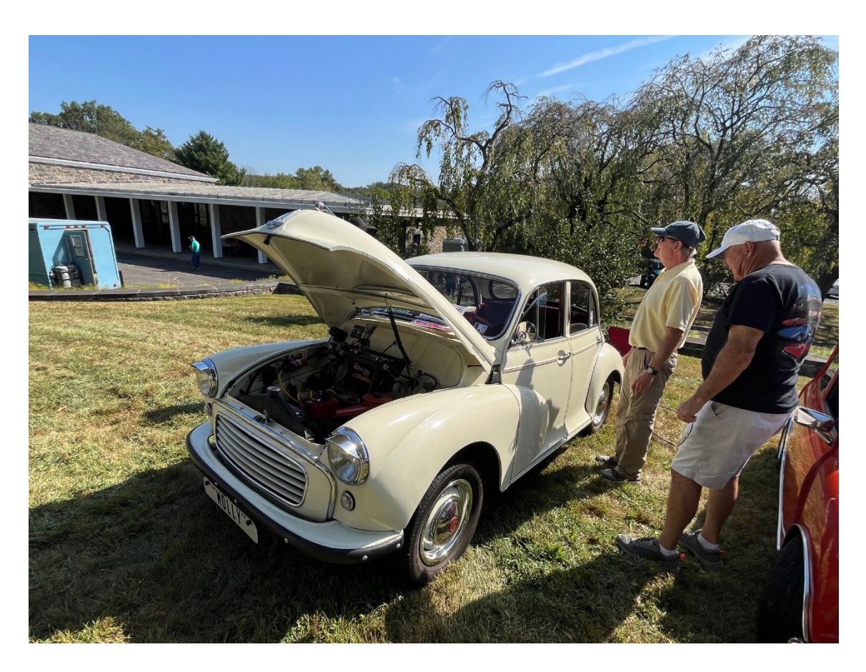
1957 Morris Minor 1000 4 Door Coupe