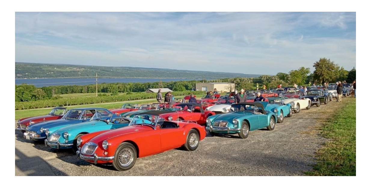
MGs by the Lake