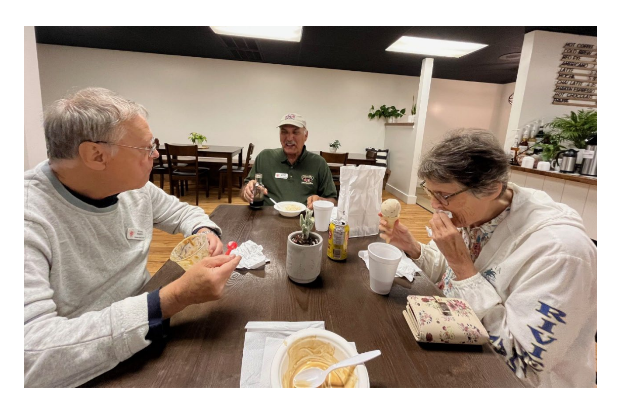
The Down on the Farm Crew