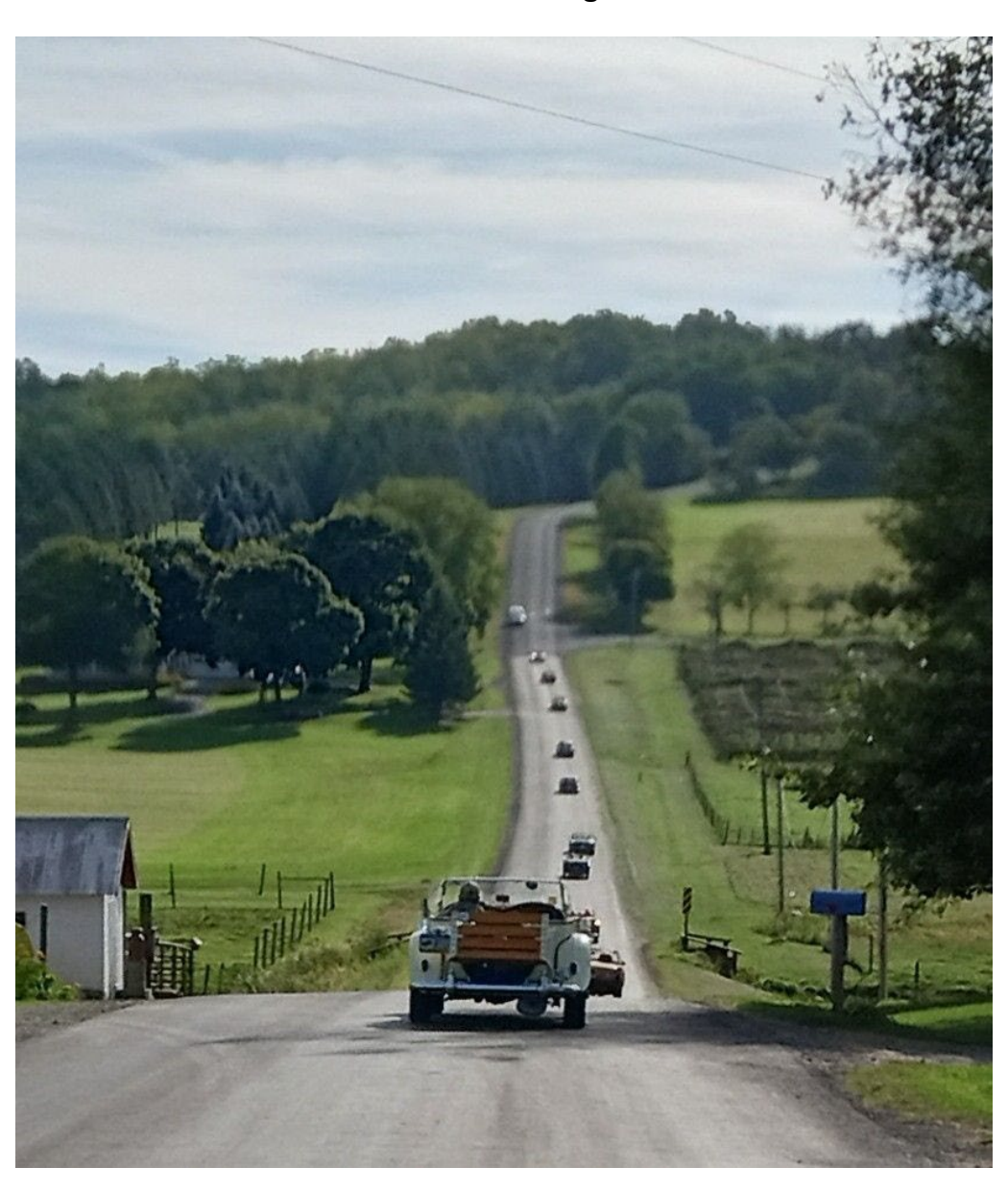
On the Tour