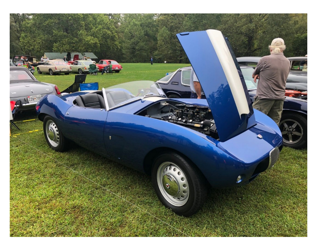
"54 Arnolt Bristol