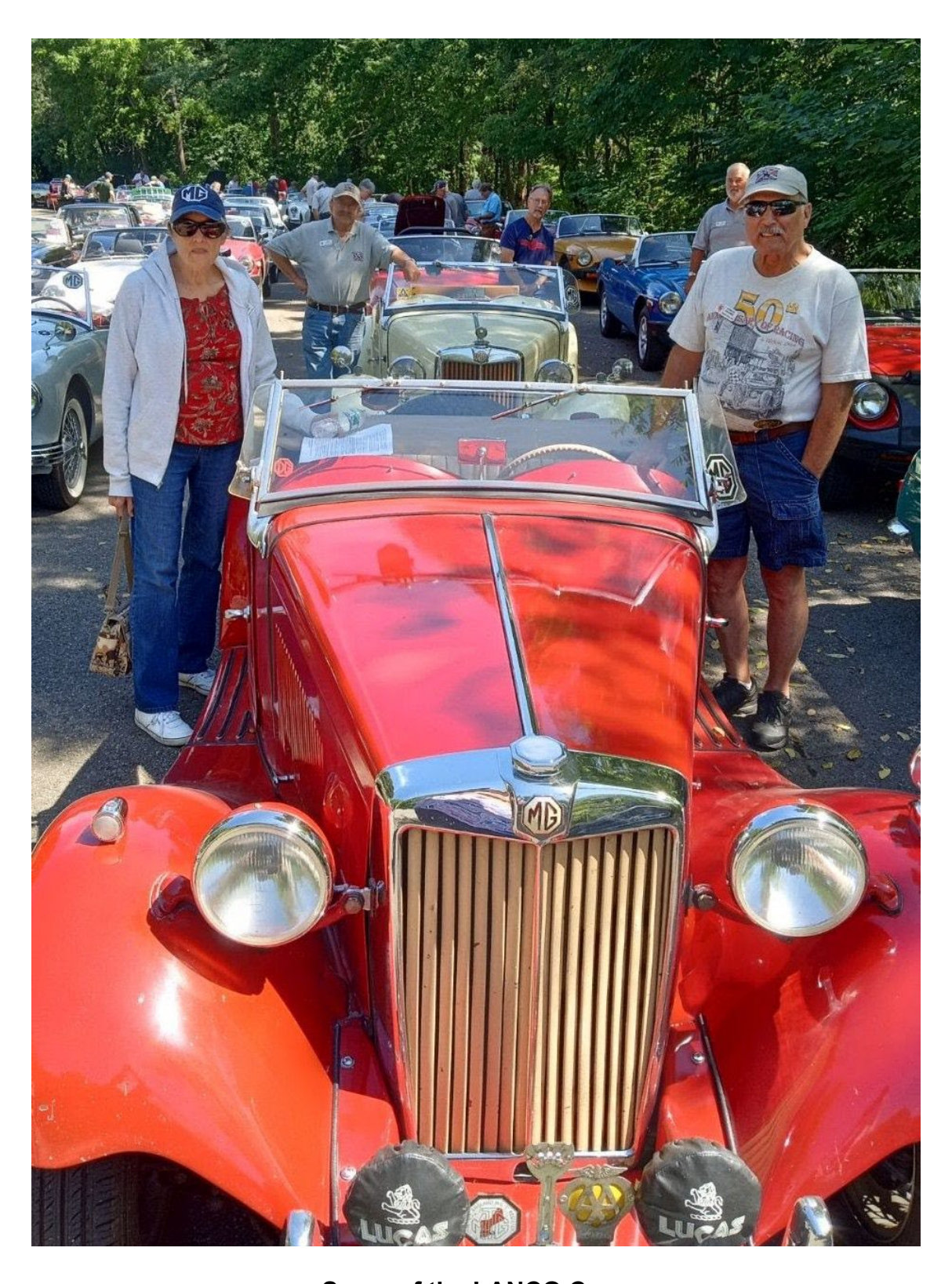
Some of the LANCO Crew