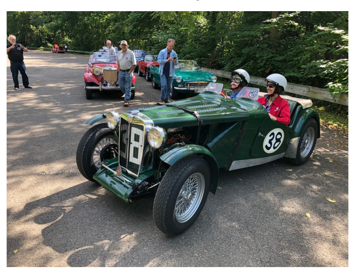
Ready for the Tour de Marque