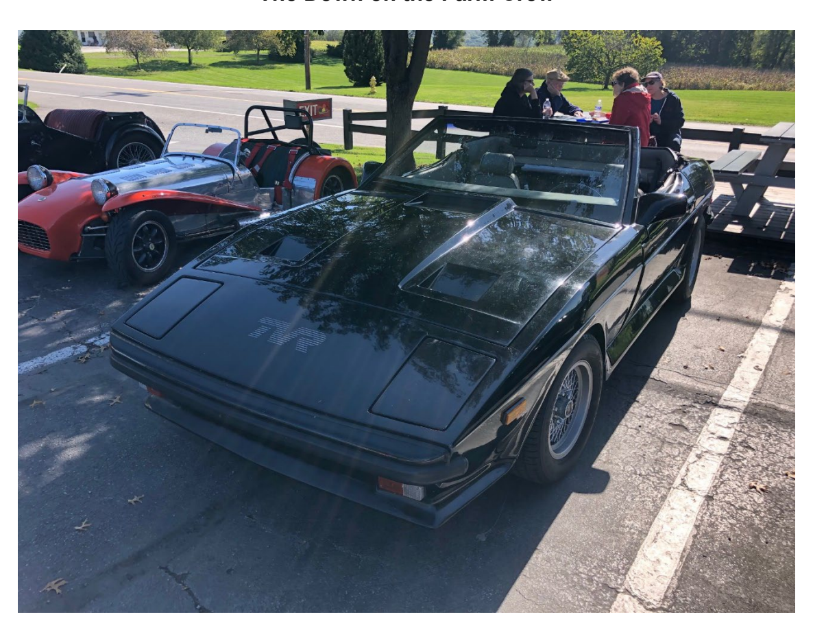
Sunny CC&C Day