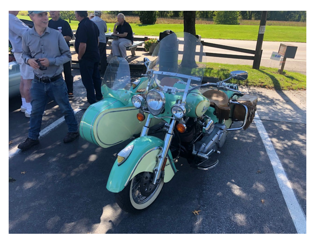
Also not British ...