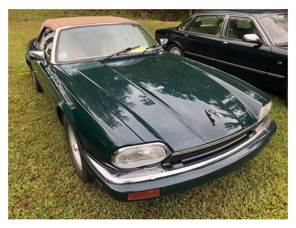
2^{nd} Place Winner for the Jaguar XJS