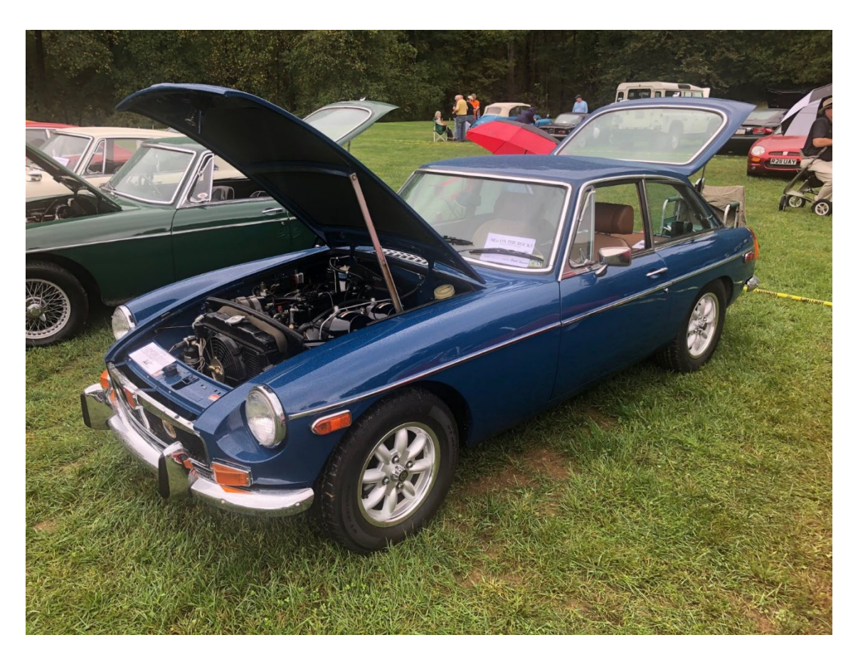
Brooks' '74 BGT