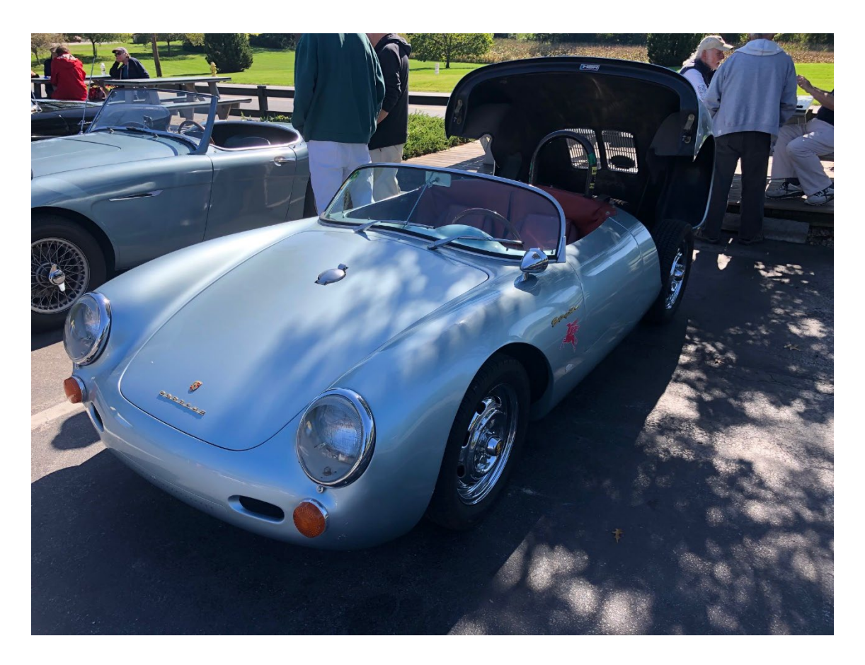
Not British ... but Nice!