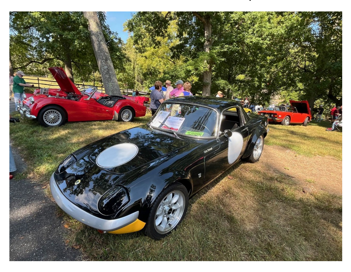
1967 Lotus Elan S3 SS Coupe