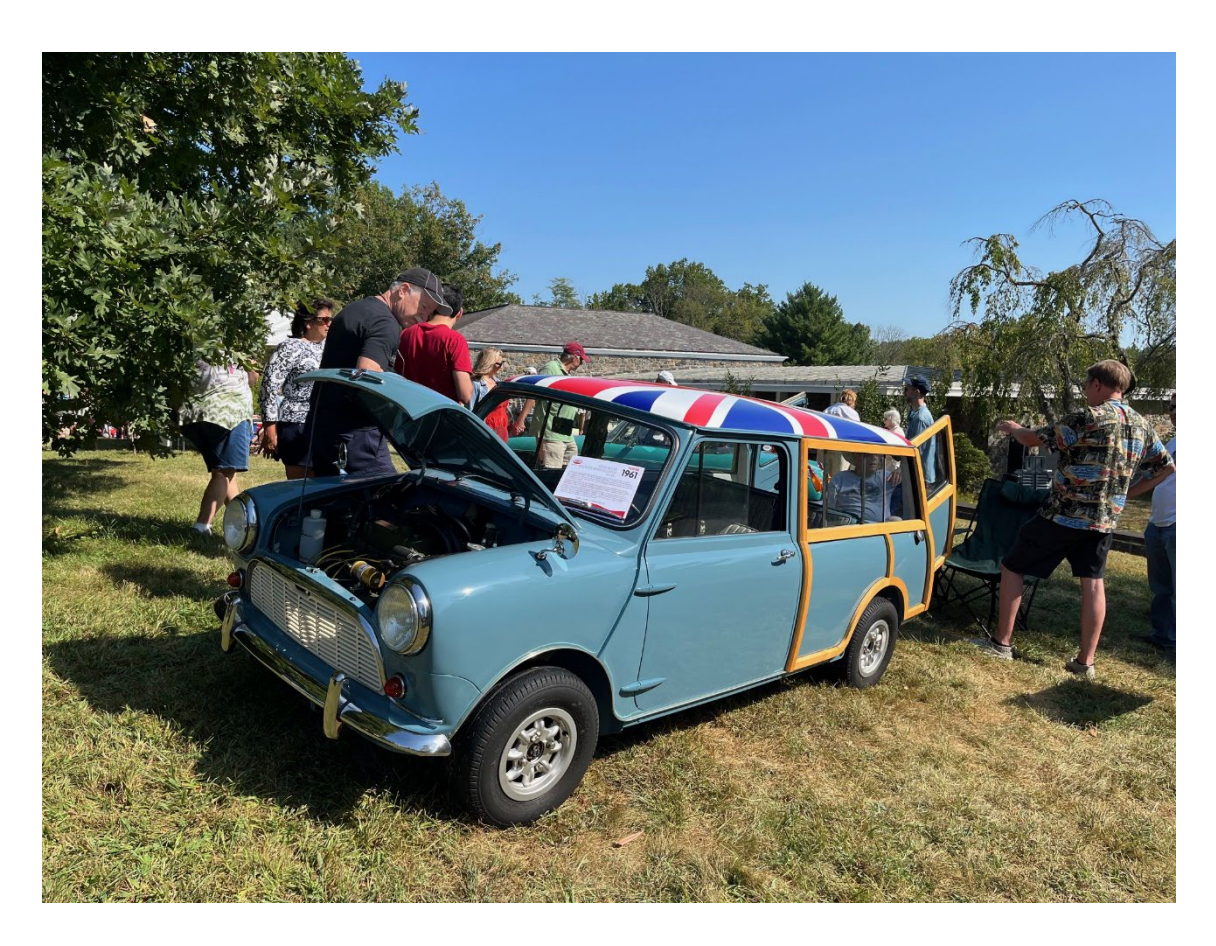
1961 Morris Mini Traveller