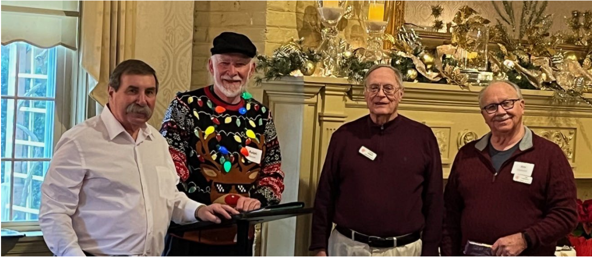
The "LANCO Tech Squad"