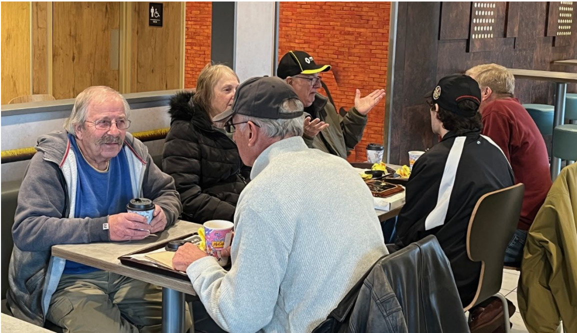
December "Crew" - 3