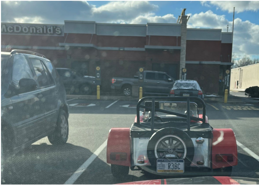
13°F Wind Chill!