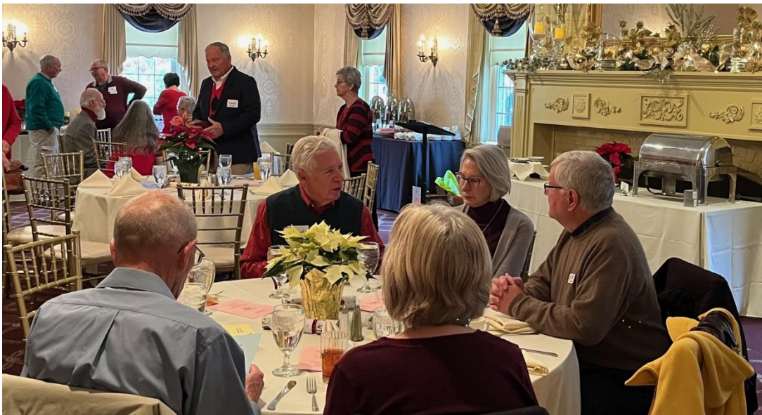
Pre-Dinner Conversations – 4