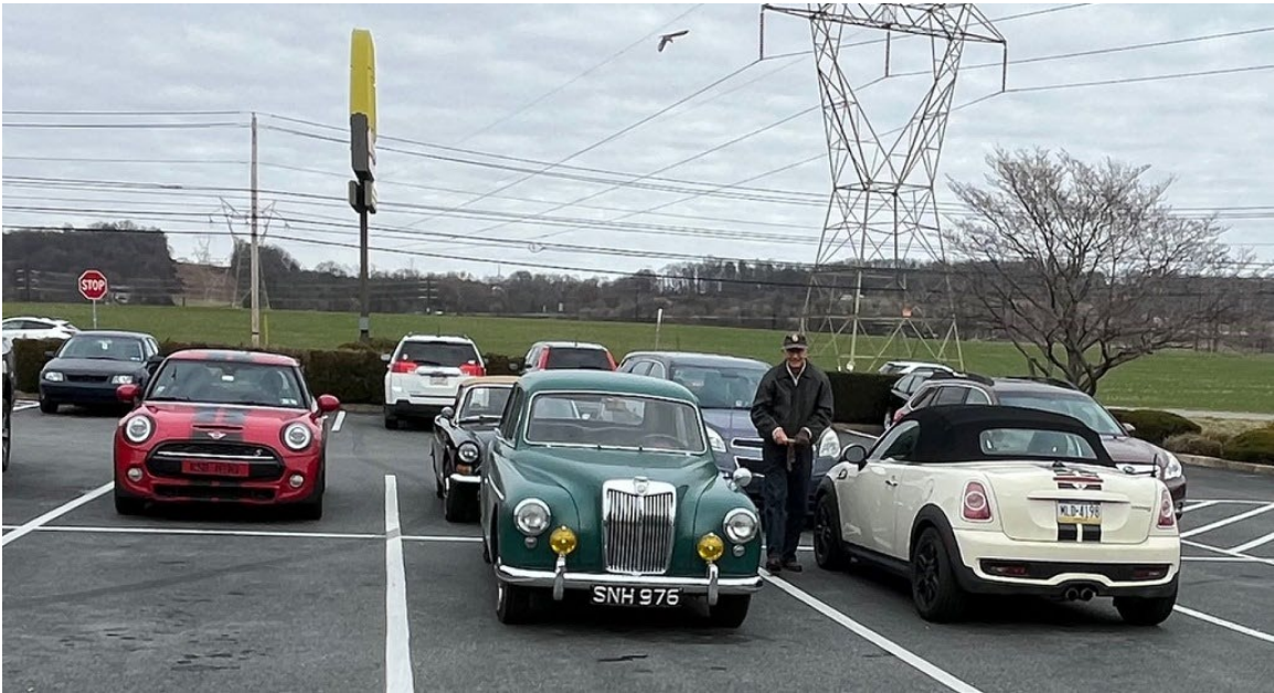
Brits at McDonald's in December