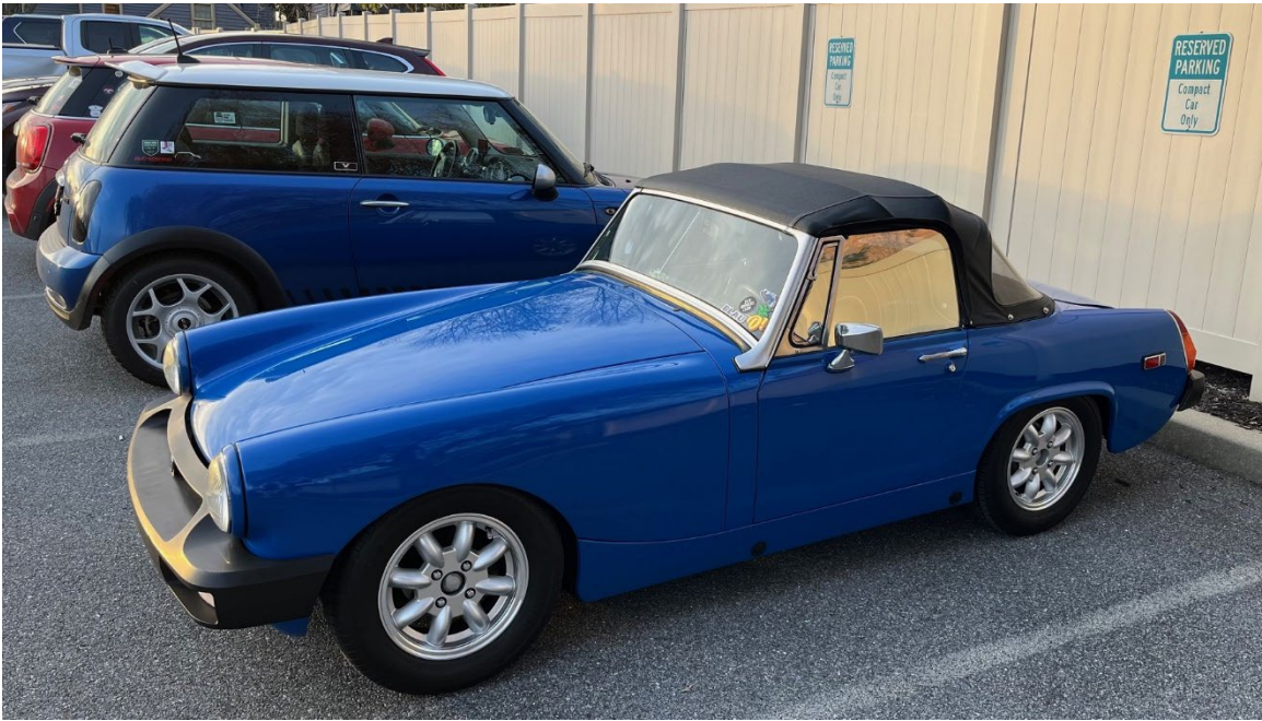
The "Hard Luck" Midget!