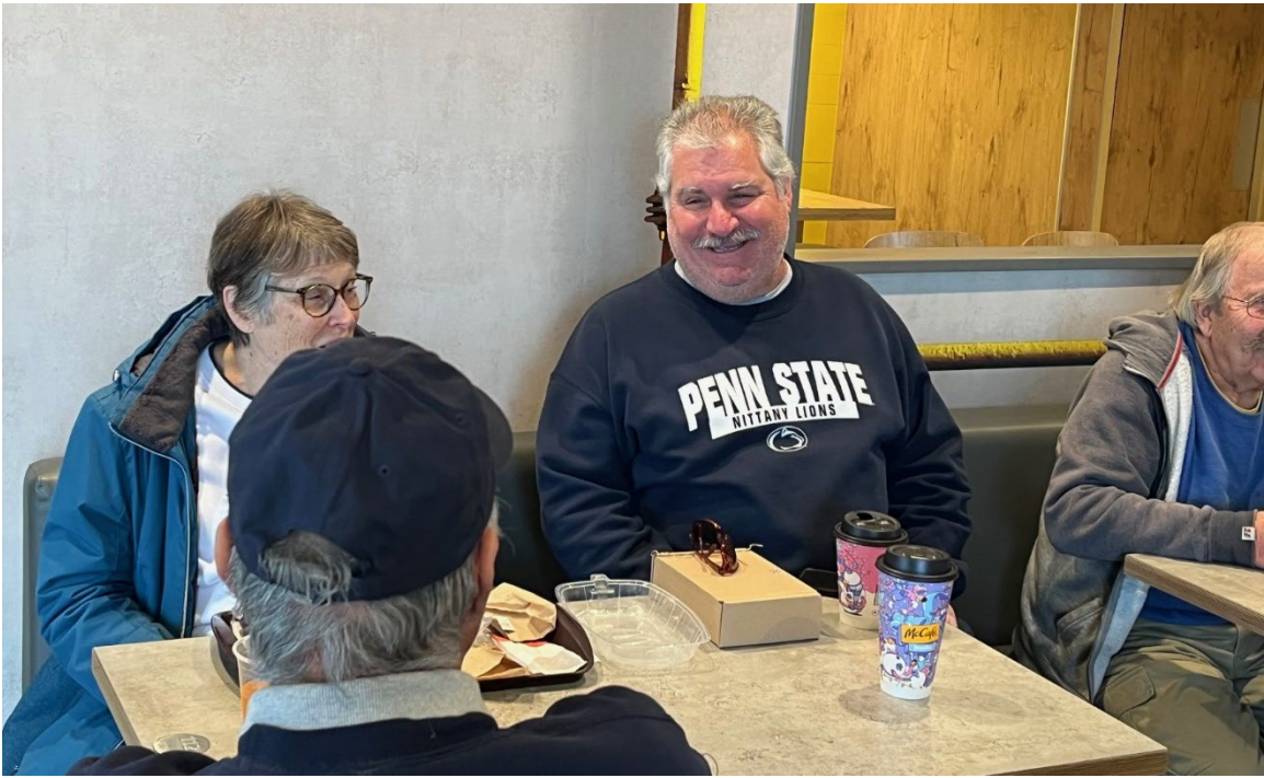
December "Crew" - 2