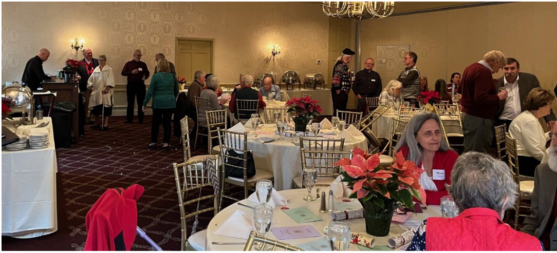
Pre-Dinner Conversations - 2