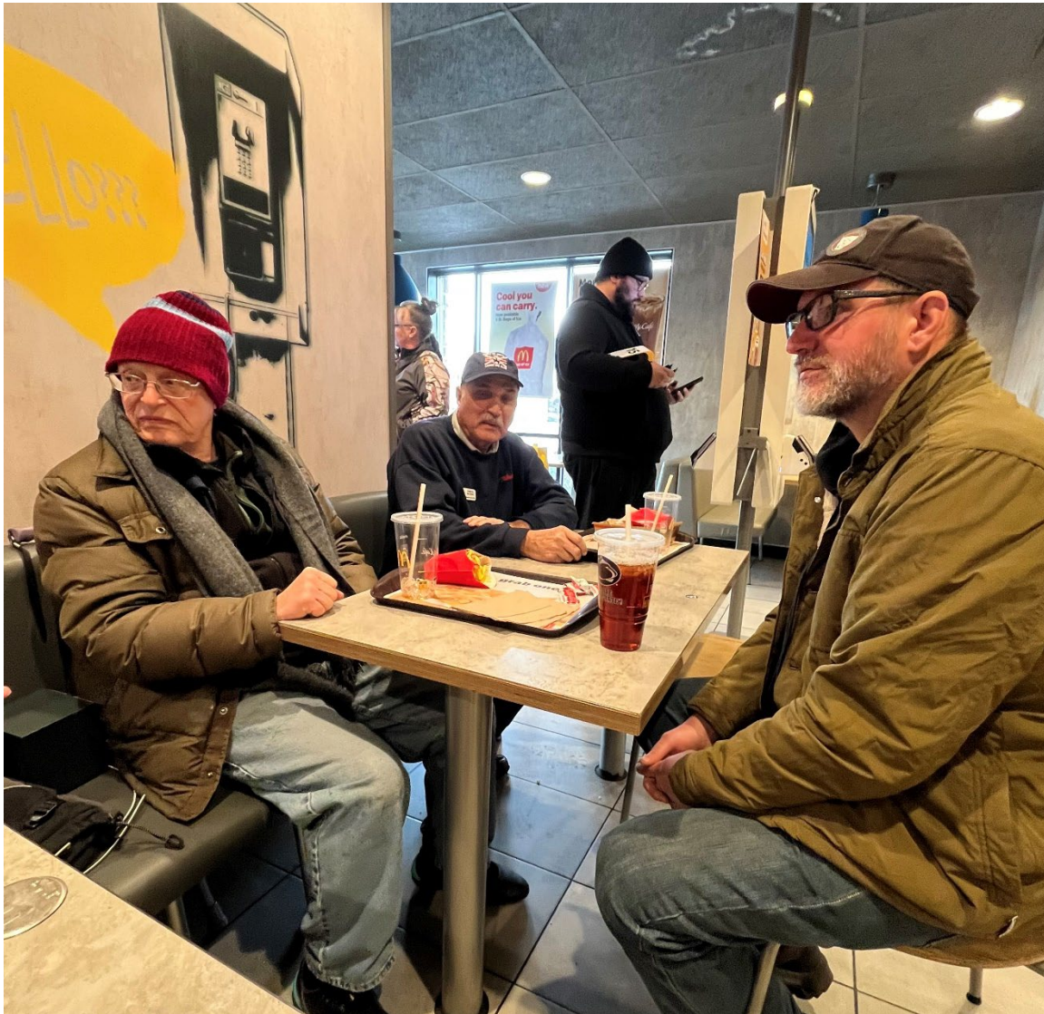
January "Crew" - 2