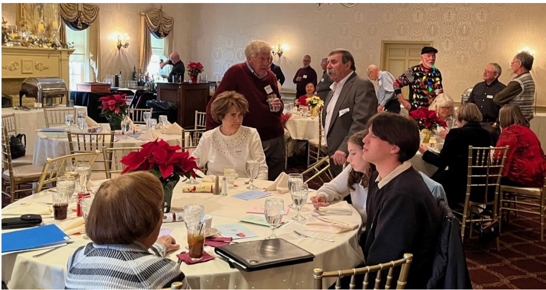
Pre-Dinner Conversations – 3