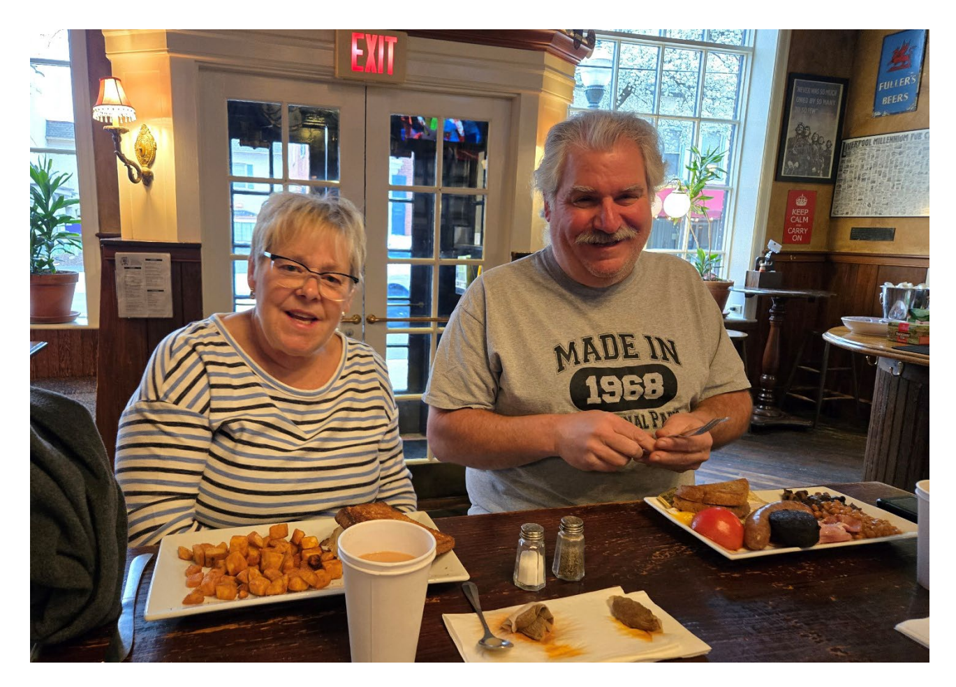
Breakfast at the Bulls Head Public House