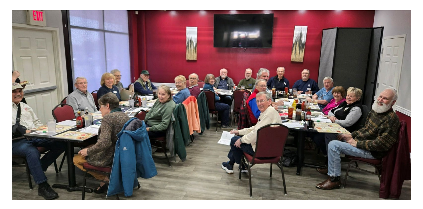
Happy Retirement from the LANCO Crew!!