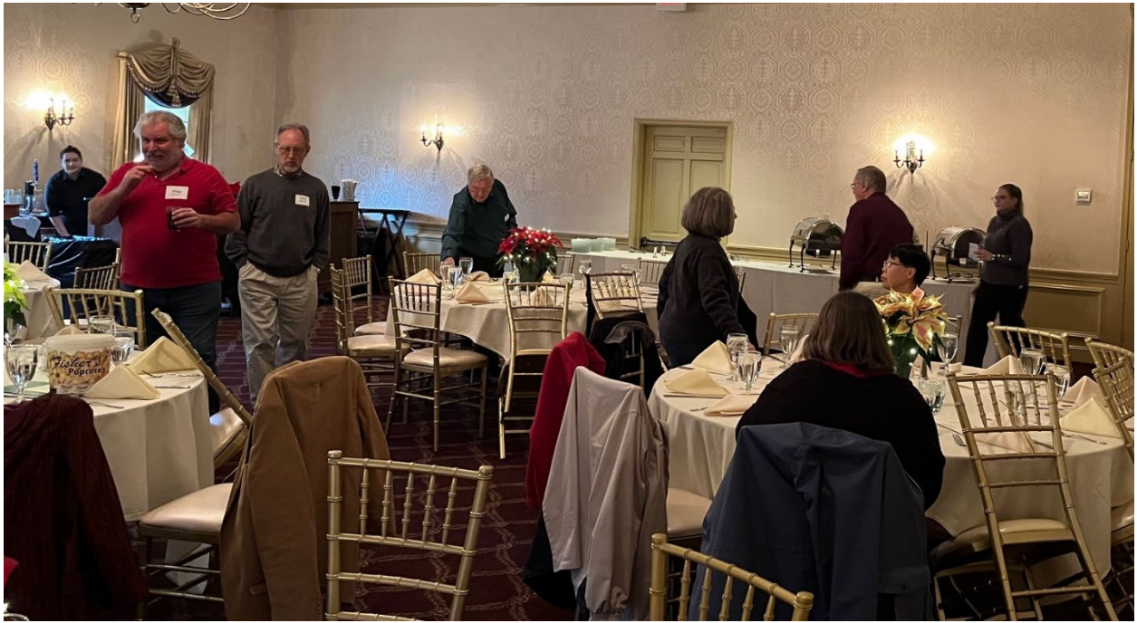
Pre-Dinner Conversations – 1