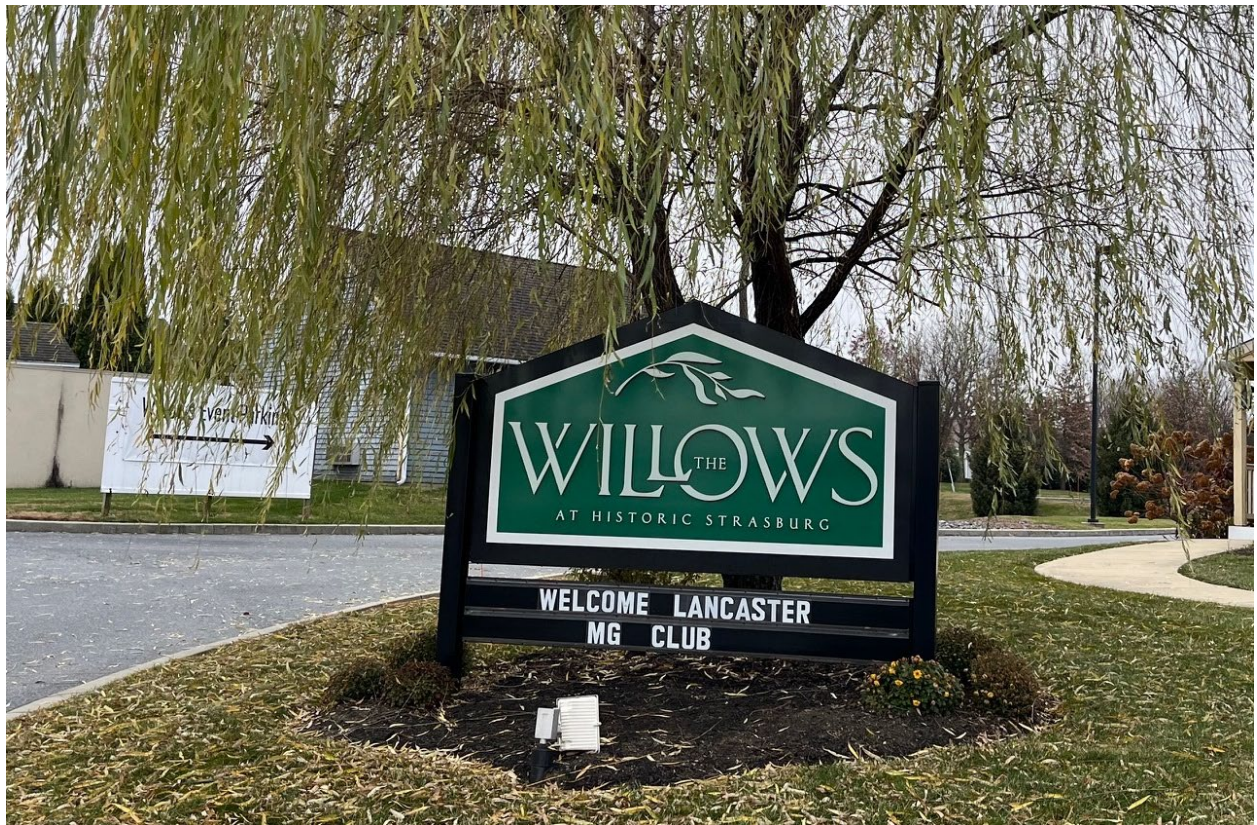
Welcome to the Willows!