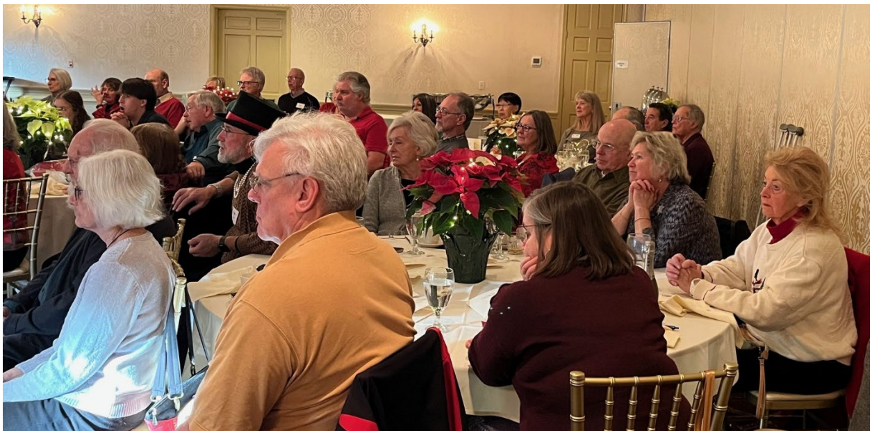
Listening to the Prez (Continued)