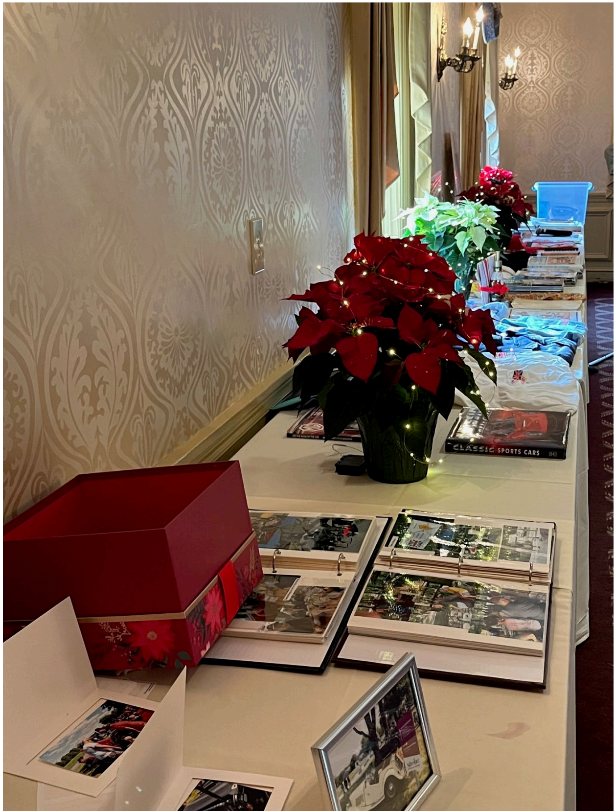
Memories and Door Prizes