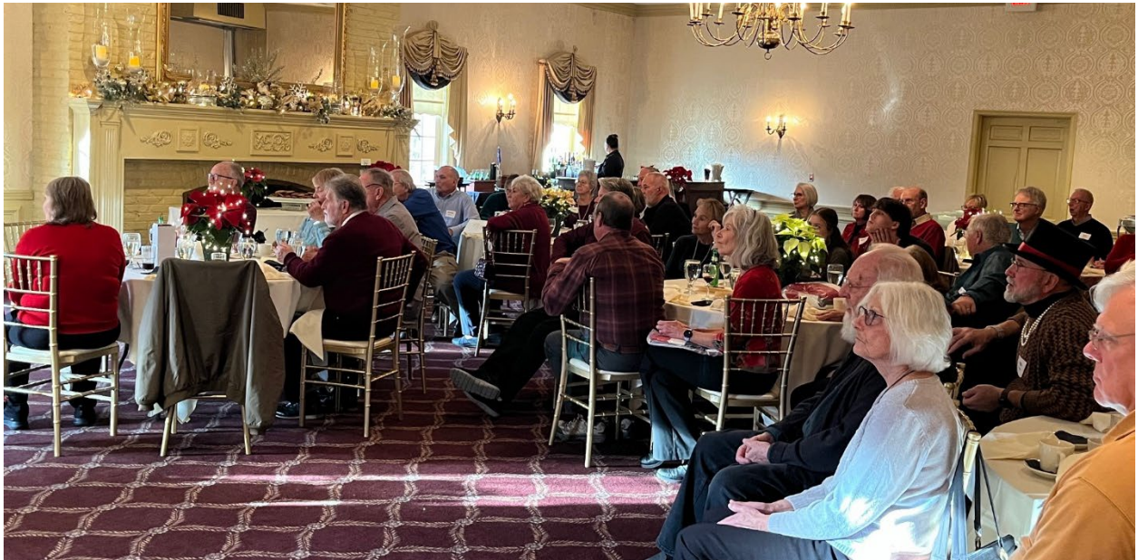
Listening to the Prez