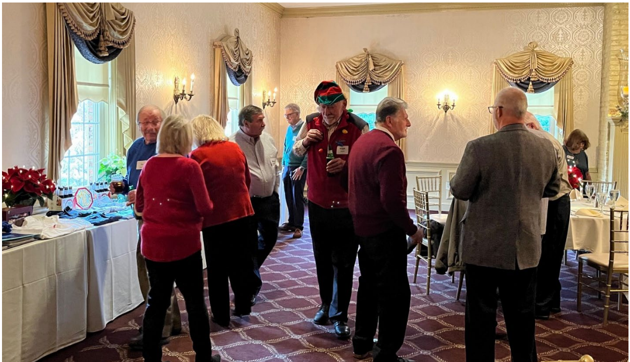
Pre-Dinner Conversations – 2